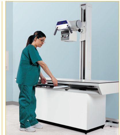
The AMRADCLASSIC ST is available with an optional attached tubestand for space-saving installation without wall or ceiling modifications.