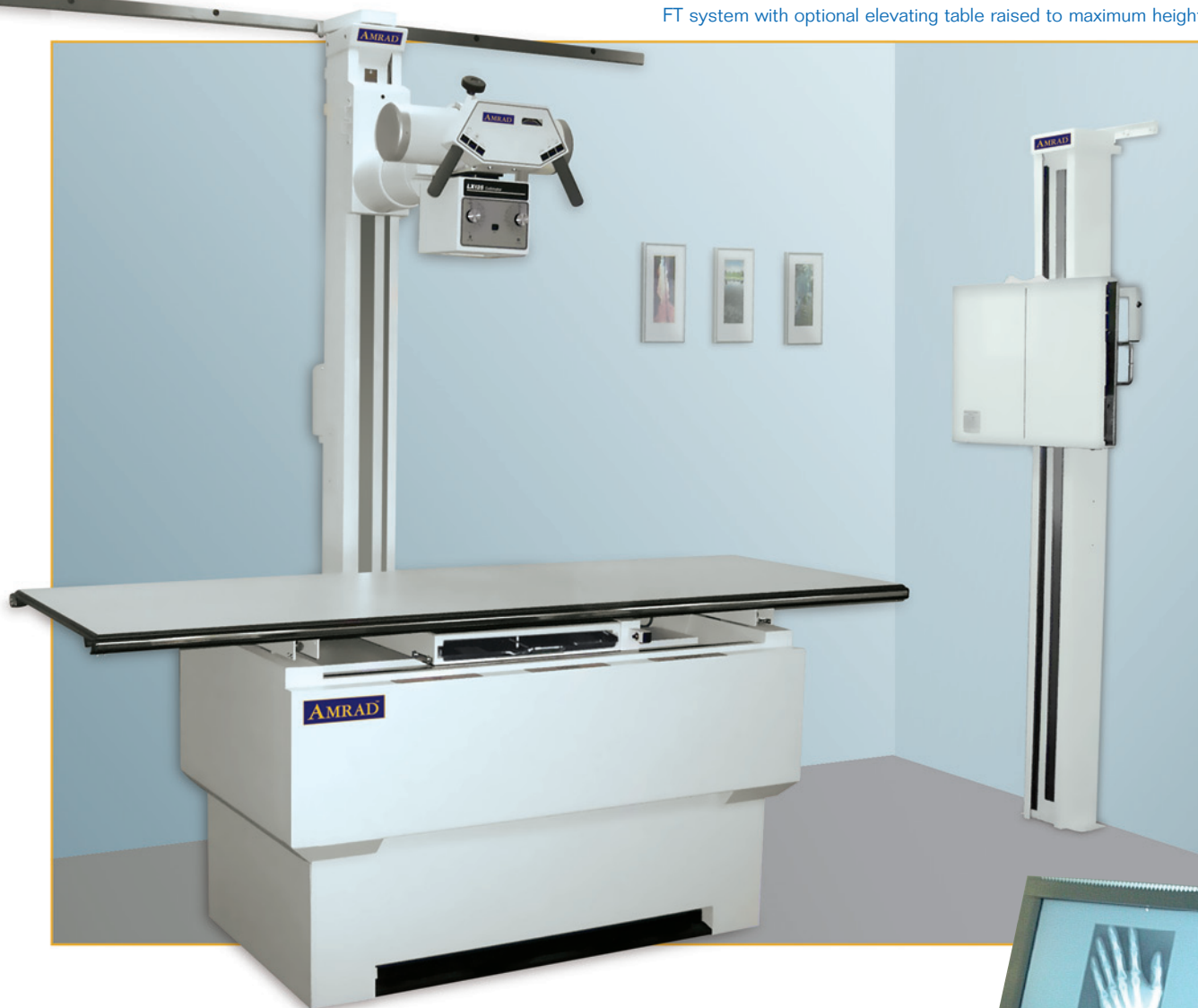
FT system with optional elevating table raised to maximum height.