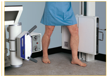
The versatile tubestand and wallstand accommodate standing knee and ankle procedures.

The ST delivers both reliability and versatility in a compact table system. Ideal for busy clinics with demanding caseloads, the heavy-duty, all-steel design and construction easily supports patients up to 300 pounds. The optional integrated tubestand is important when space is at a premium. The AMRADCLASSIC ST design provides continuous attachment of the tubestand to the table and installs without modification to most office walls or ceilings. A unique off-table tubestand option accommodates a full range of procedures including standing knee and ankle.